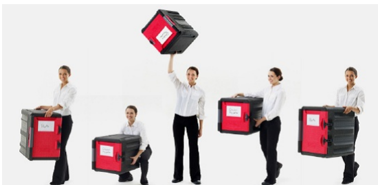
Metro MightyLite™ Insulated Pan Carriers

Take the heat out of the kitchen! Traulsen's G-Series and R & A Series refrigerators and freezers offer optional remote compressors to keep your kitchen cool and quiet. Many of the other leading brands can't offer this feature. Email us at premiermktg@kitchenreps.com to learn more.